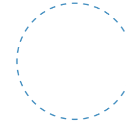
To be confirmed... Guides @L'architecture qui dégenre

A community-led initiative to create an 'ideal' new park on the land between Beekkant and Osseghem.